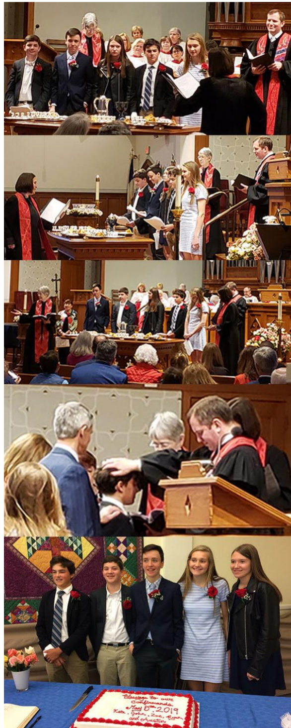
This year's Hills Church Confirmation Class (from left to right)